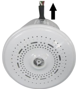
Figure 2. Power cord must be in up position as shown above