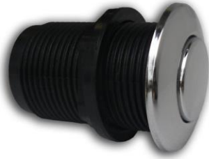
Fig. 2 LURACO's Air Button